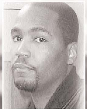
UNIA Minister Of Education Umar Abdullah Johnson